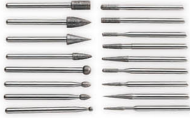
BM Series - \varnothing 3.0\text{mm} shank